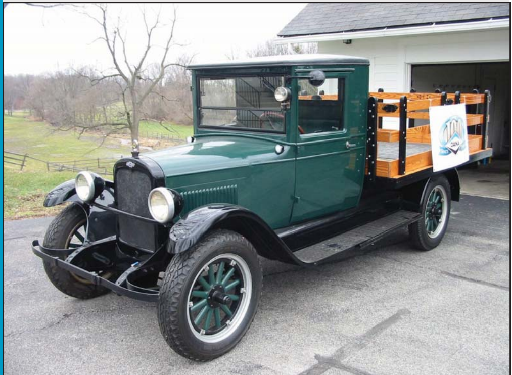
1927 Chevrolet Stake Truck, Restored - 53,633 Miles

ONLINE BIDDING AVAILABLE! Go To www.pamelaroseauction.com - Then Click Online Auctions!