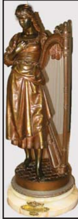
Spelter "Lion du Pays" Bronze Statue