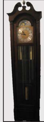
Howard Miller Mahogany Grandfather Clock